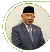
H.E. Husin Bagis Ambassador of the Republic of Indonesia to the United Arab Emirates